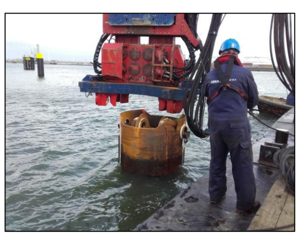
Drilling the pile into place