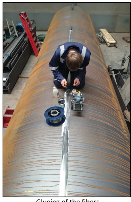
Glueing of the fibers

In order to measure the physical deformation a 22m long SAAF was installed in a tubular profile welded to the pile.